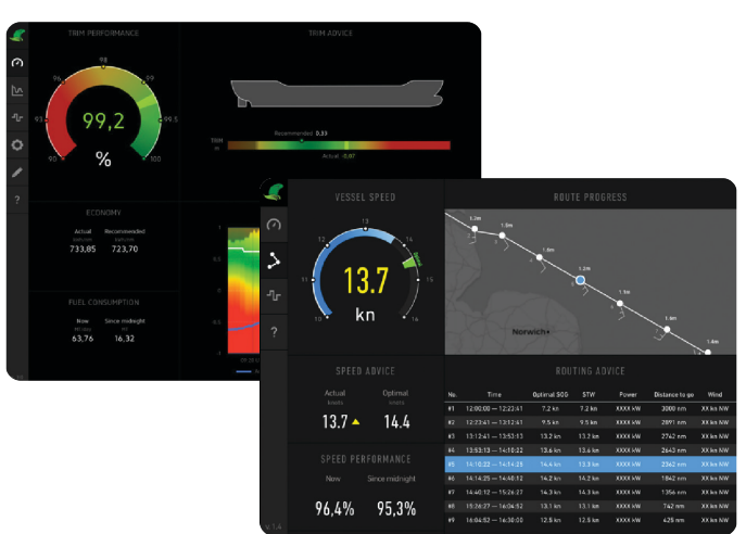
Speed Optimizer Module